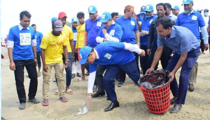
Lifeguards are working in the beach cleaning programme

CIPRB provided necessary support and participating in different events. The lifeguards working under SeaSafe project attended in the opening ceremony, rally, and day-long beach cleaning programme. They also perform drowning rescue demonstration.