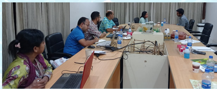
Training sessions of the Data collectors

Bhasa 1 study and identify the stakeholders working on them. Data collection was completed and report generation is under process of the research.