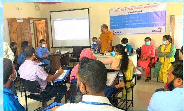
A session is conducting by the MEL Manager

In addition, the existing reporting and documentation format review was another awesome and important work of the workshop. Pre-listed reporting formats, data collection tools, information of registers were revealed. The MEL team expects that after incorporating the inputs the formats will be comprehensive, user-friendly, and help to ensure the uniqueness in each Upazila, the project catchment area of PROJECT Bhasha-2.